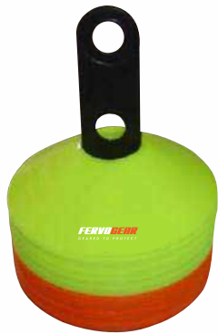
50 CONE SET