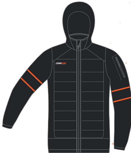
SUB ZERO JACKET