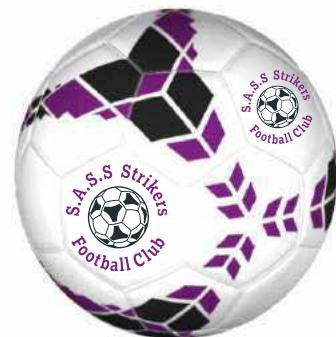
CUSTOM TRAINING BALLS