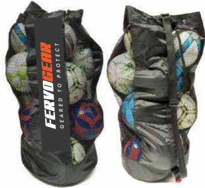
BALL CARRY BAG